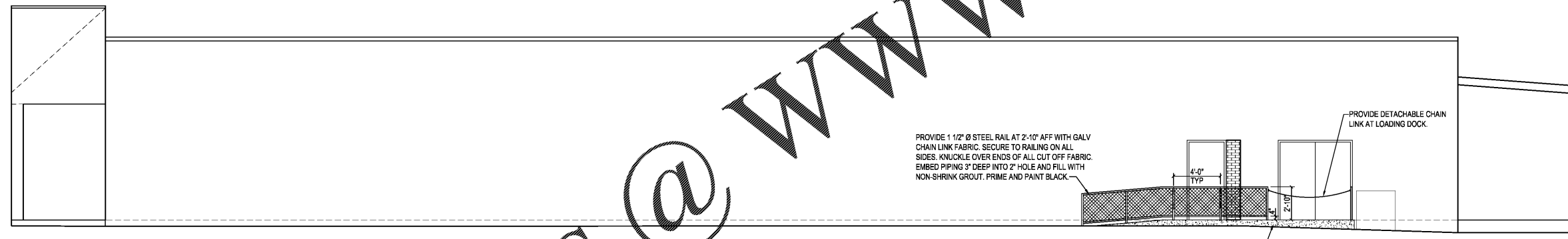
B EXTERIOR ELEVATION A3.1 SCALE: 1/4" = 1'-0"